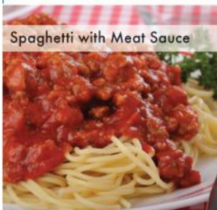
Spaghetti with Meat Sauce